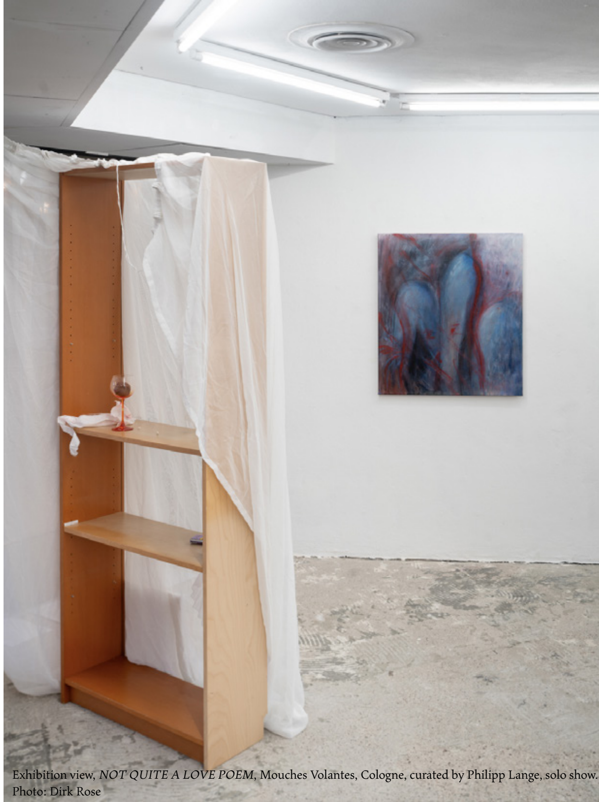
Exhibition view, NOT QUITE A LOVE POEM , Mouches Volantes, Cologne, curated by Philipp Lange, solo show.