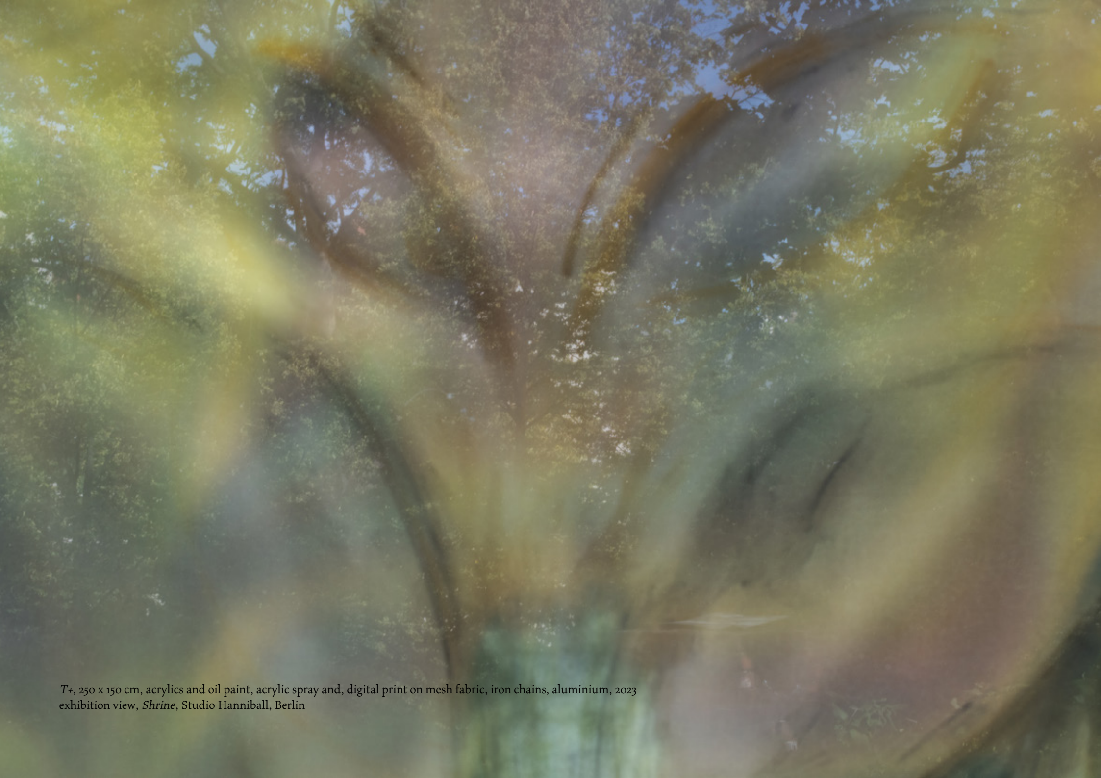
T+ , 250 x 150 cm, acrylics and oil paint, acrylic spray and, digital print on mesh fabric, iron chains, aluminium, 2023 exhibition view, Shrine , Studio Hanniball, Berlin