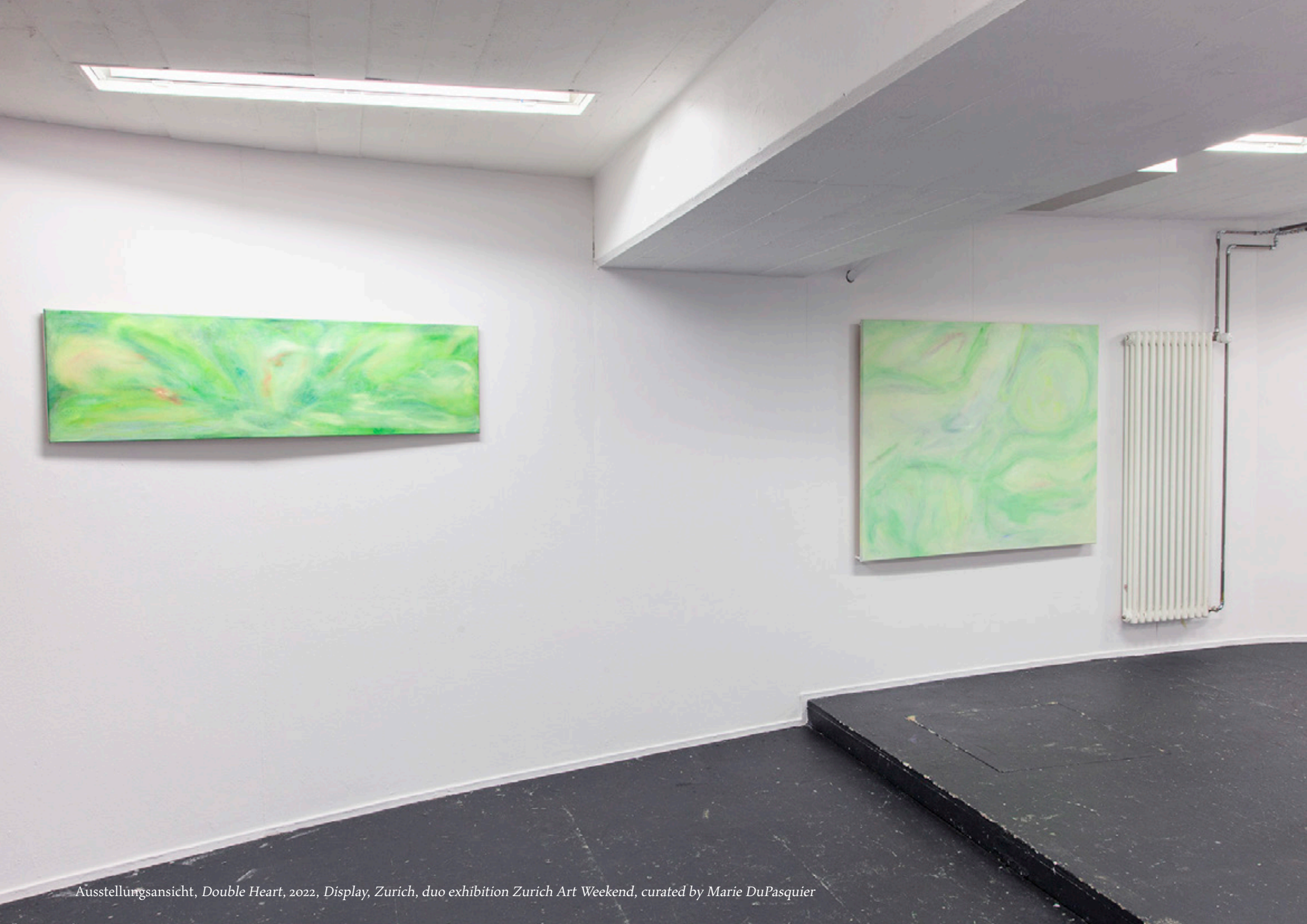
Ausstellungsansicht, Double Heart , 2022, Display , Zurich, duo exhibition Zurich Art Weekend, curated by Marie DuPasquier