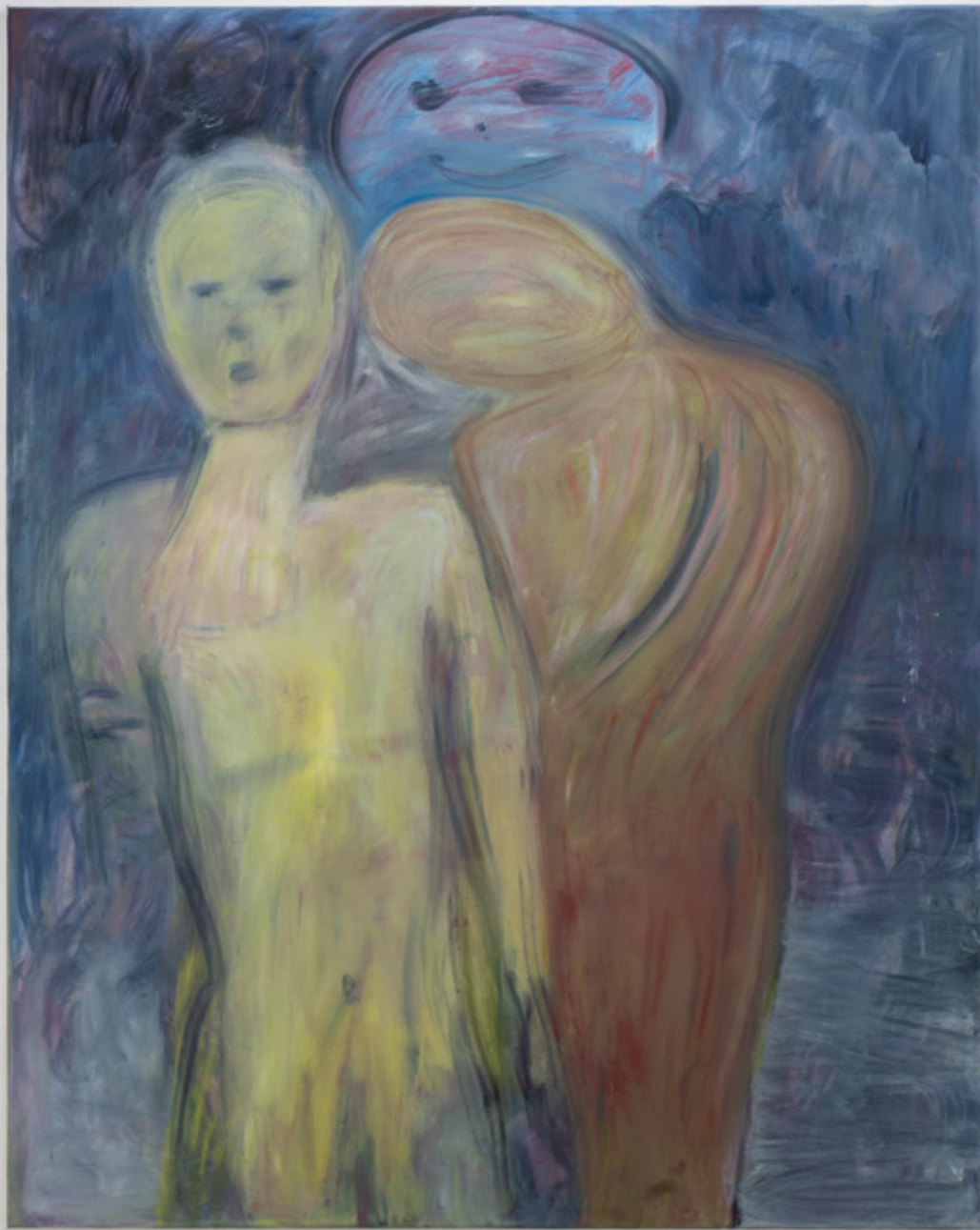
Serenity II , 2024, Oil on canvas, 200 x 160 cm.