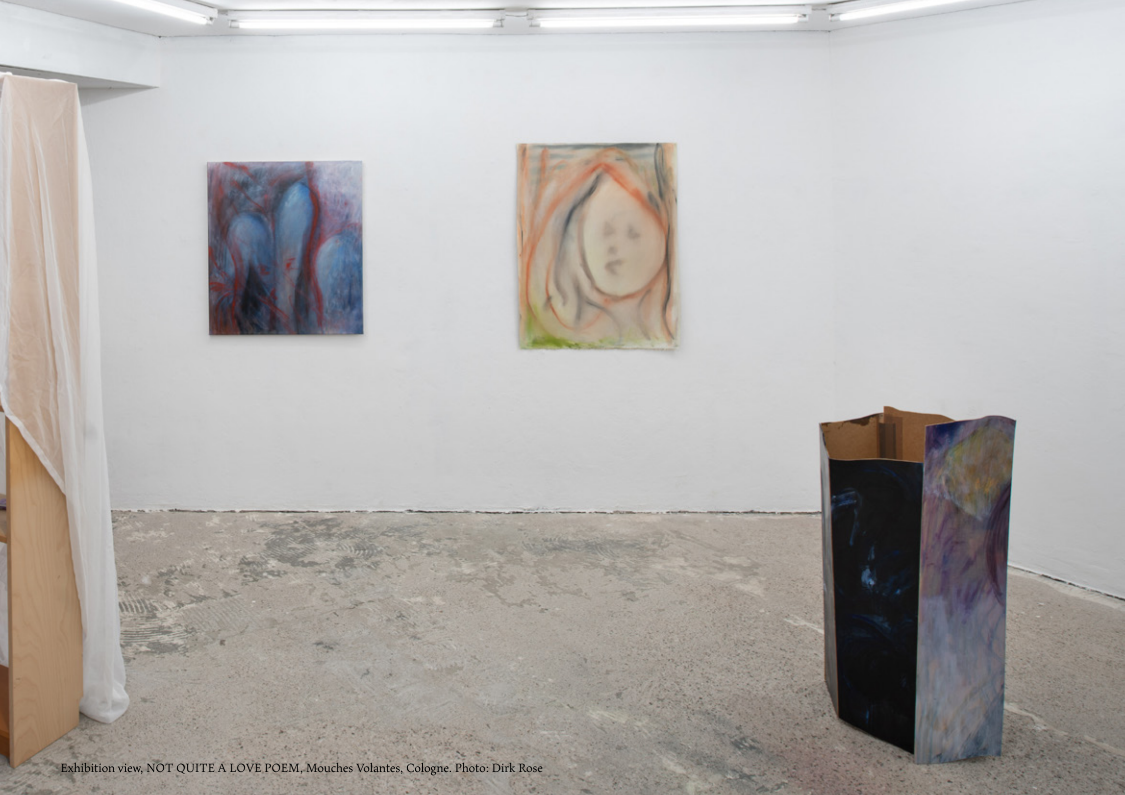
Exhibition view, NOT QUITE A LOVE POEM, Mouches Volantes, Cologne.