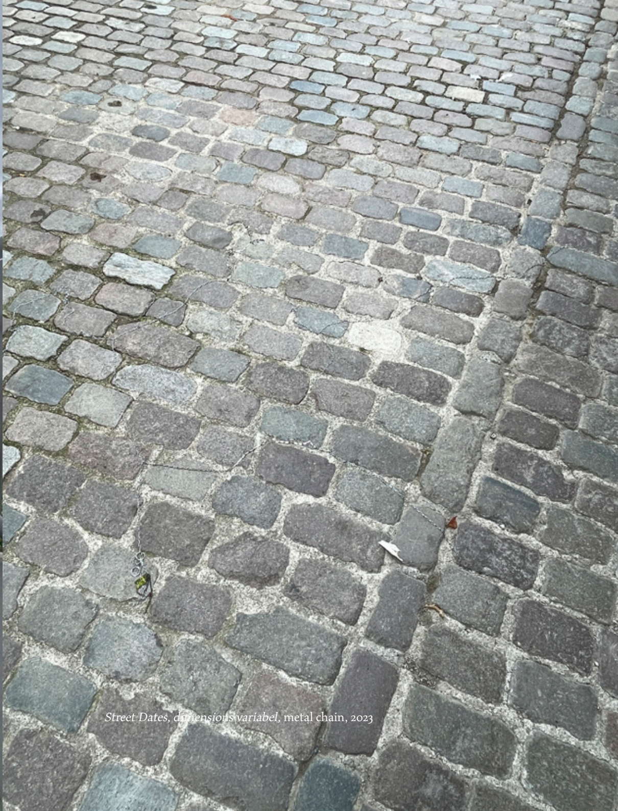
Street Dates , dimensions variabel, metal chain, 2023