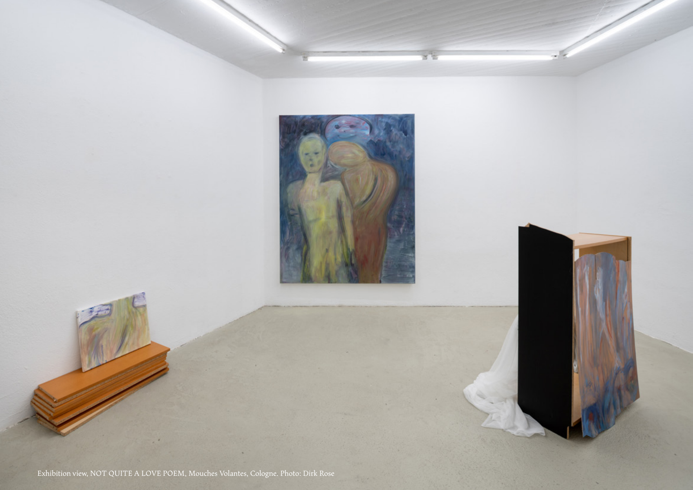
Exhibition view, NOT QUITE A LOVE POEM, Mouches Volantes, Cologne.