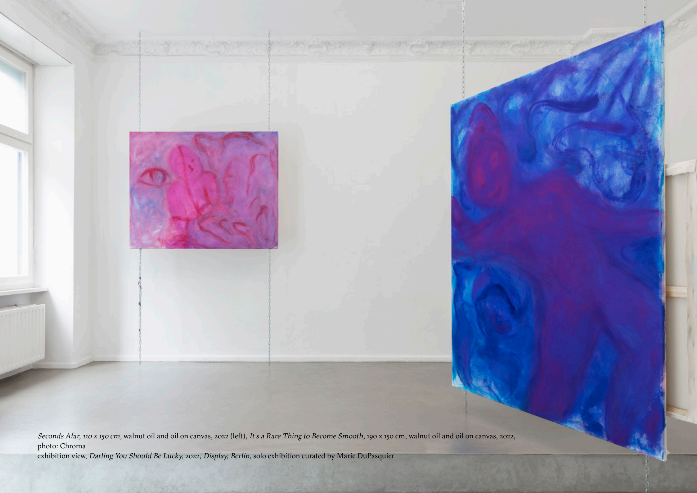
Seconds Afar , 110 x 150 cm, walnut oil and oil on canvas, 2022 (left), It's a Rare Thing to Become Smooth , 190 x 150 cm, walnut oil and oil on canvas, 2022, photo: Chroma exhibition view, Darling You Should Be Lucky , 2022, Display , Berlin, solo exhibition curated by Marie DuPasquier