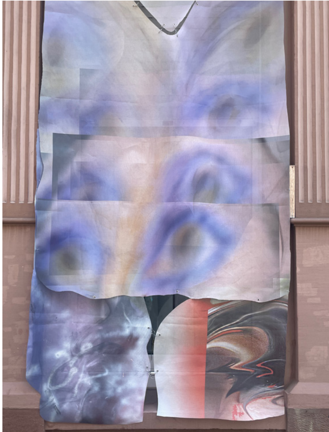
S-e-e-d-s , 300 x 120 cm, Acrylic and oil paint, acrylic spray, digital print on mesh fabric, steel chains, aluminium, 2023 (exhibition venues in public space in Freiburg) Exhibition view, Das Lied der Straße , Biennale für Freiburg 2