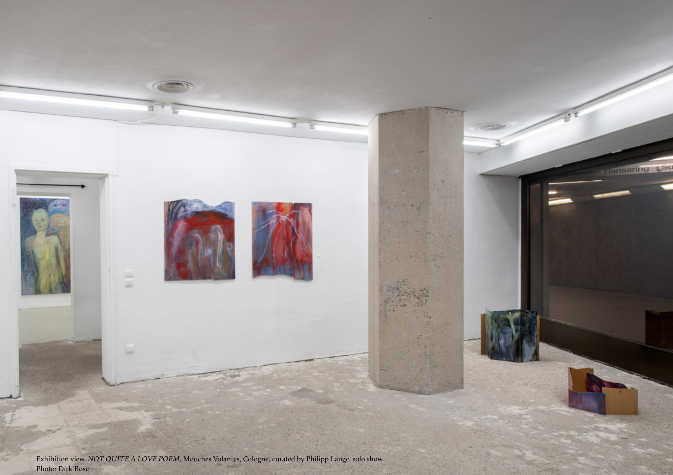
Exhibition view, NOT QUITE A LOVE POEM , Mouches Volantes, Cologne, curated by Philipp Lange, solo show.