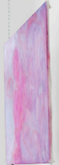
Seconds Afar , 110 x 150 cm, Oil on canvas., 2022. Photo: Chroma exhibition view, Darling You Should Be Lucky , 2022, Display , Berlin, solo exhibition curated by Marie DuPasquier