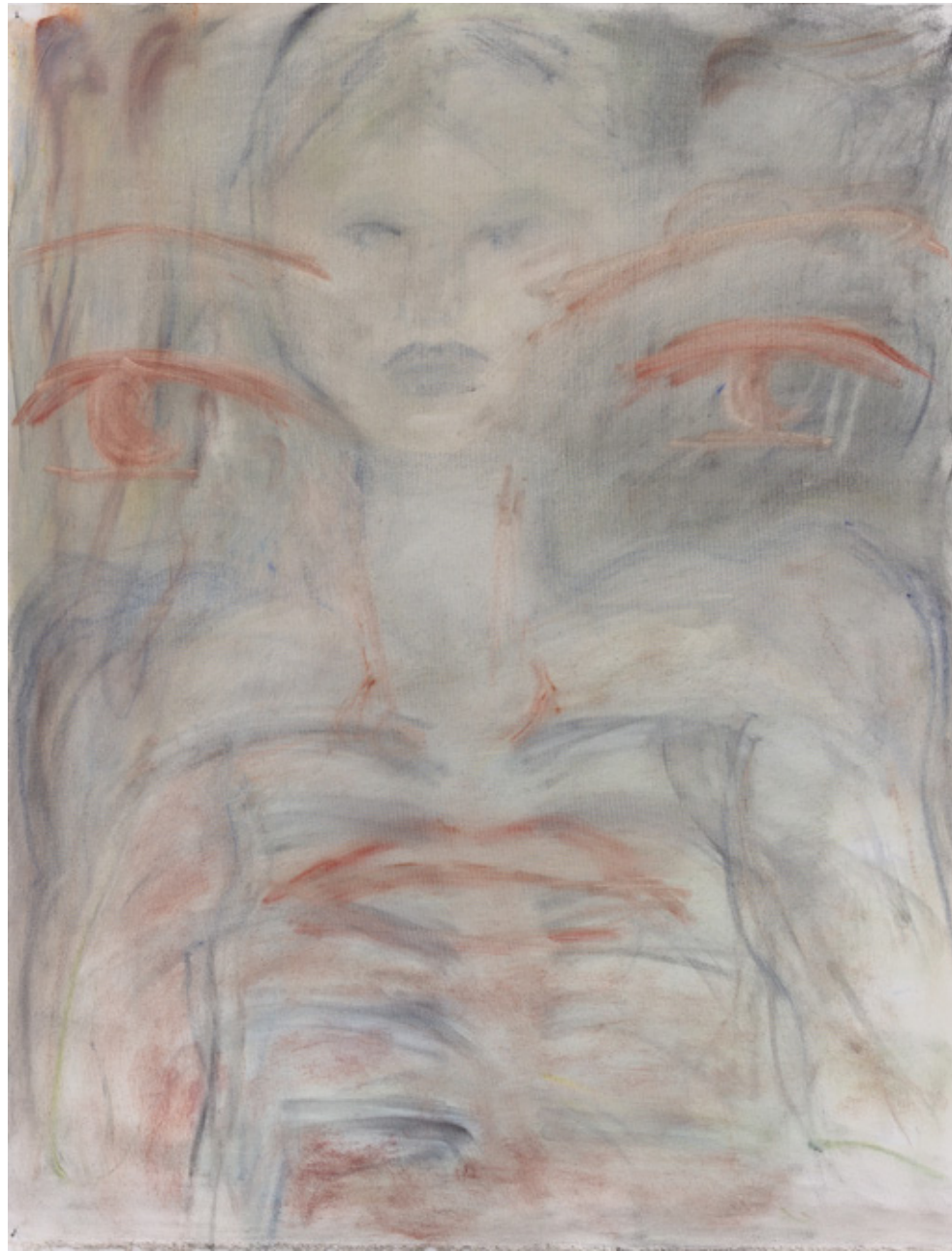
<them>, 110 x 90 cm, walnut oil and oil on canvas, 2023