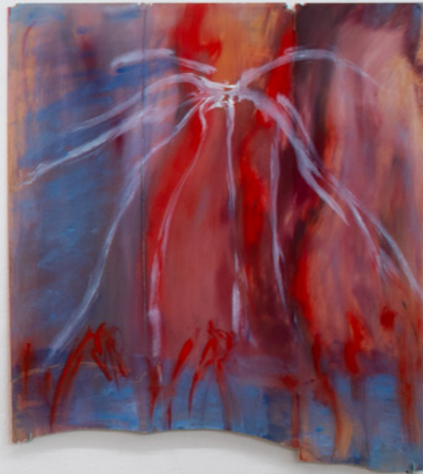
Exhibition view, NOT QUITE A LOVE POEM , Mouches Volantes, Cologne, curated by Philipp Lange, solo show. Searching for fate , 2024, Oil on IKEA Billy shelf, 82 x 77,5 cm (left), Bb it's fiery , 2024, Oil on IKEA Billy shelf, 87 x 77 cm