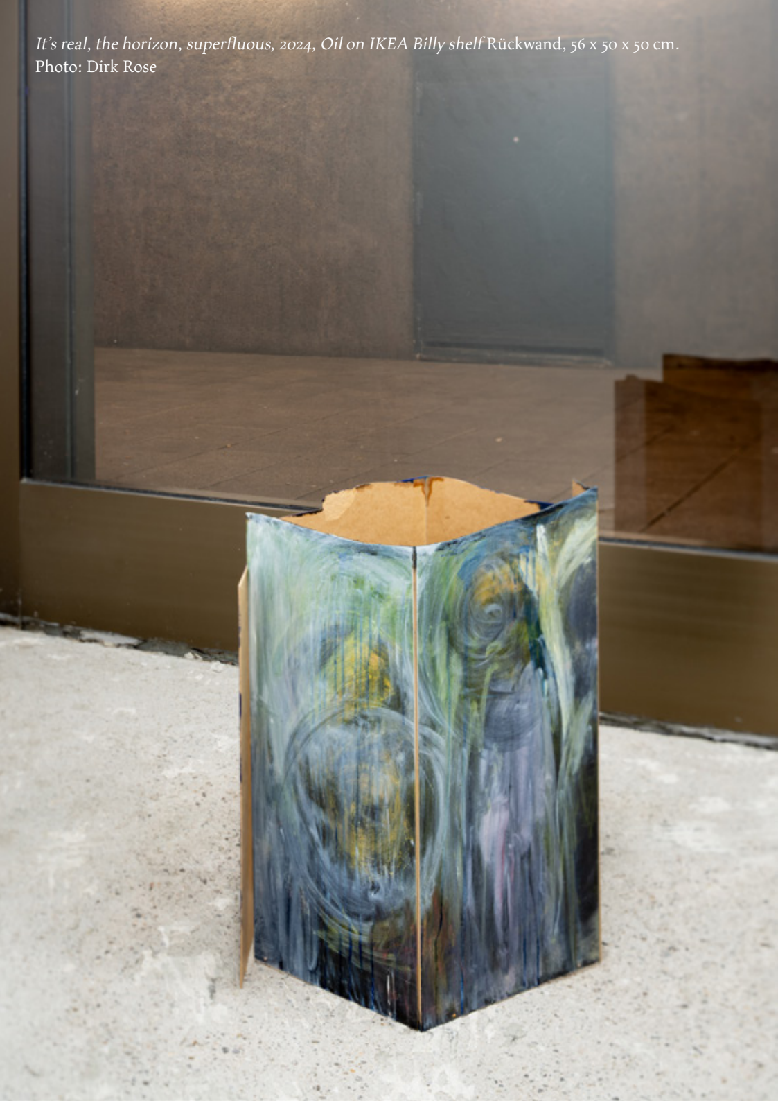
It's real, the horizon, superfluous, 2024, Oil on IKEA Billy shelf Rückwand, 56 x 50 x 50 cm.