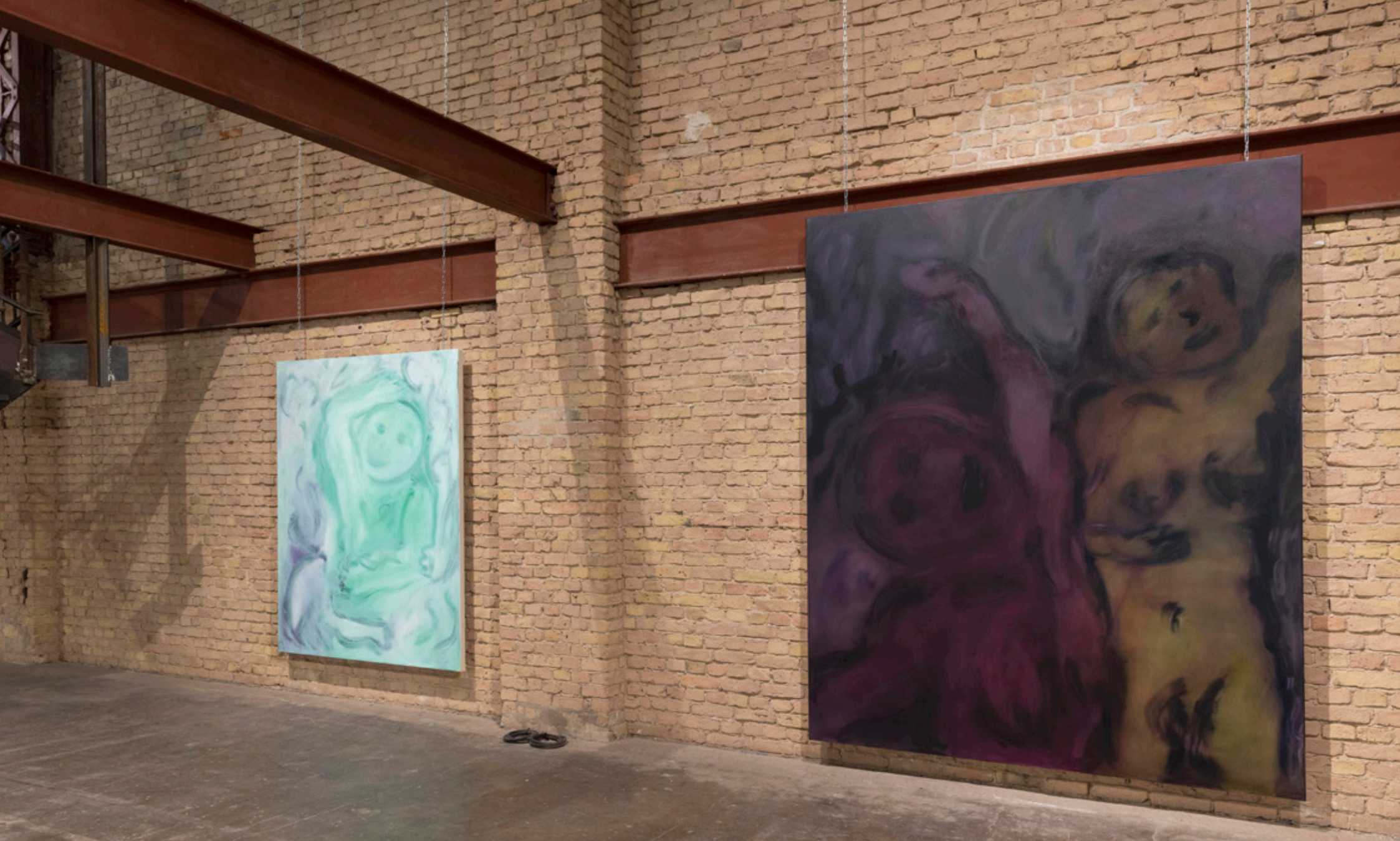
Vixen , 200 x 160 cm, walnut oil and oil on canvas, 2021 (left), Serenity , 270 x 220 cm, walnut oil and oil on canvas, 2021 (right) exhibition view, it's only the end , Kühlhaus Berlin, 2021, curated by Klara Hülskamp and Philipp Lange.