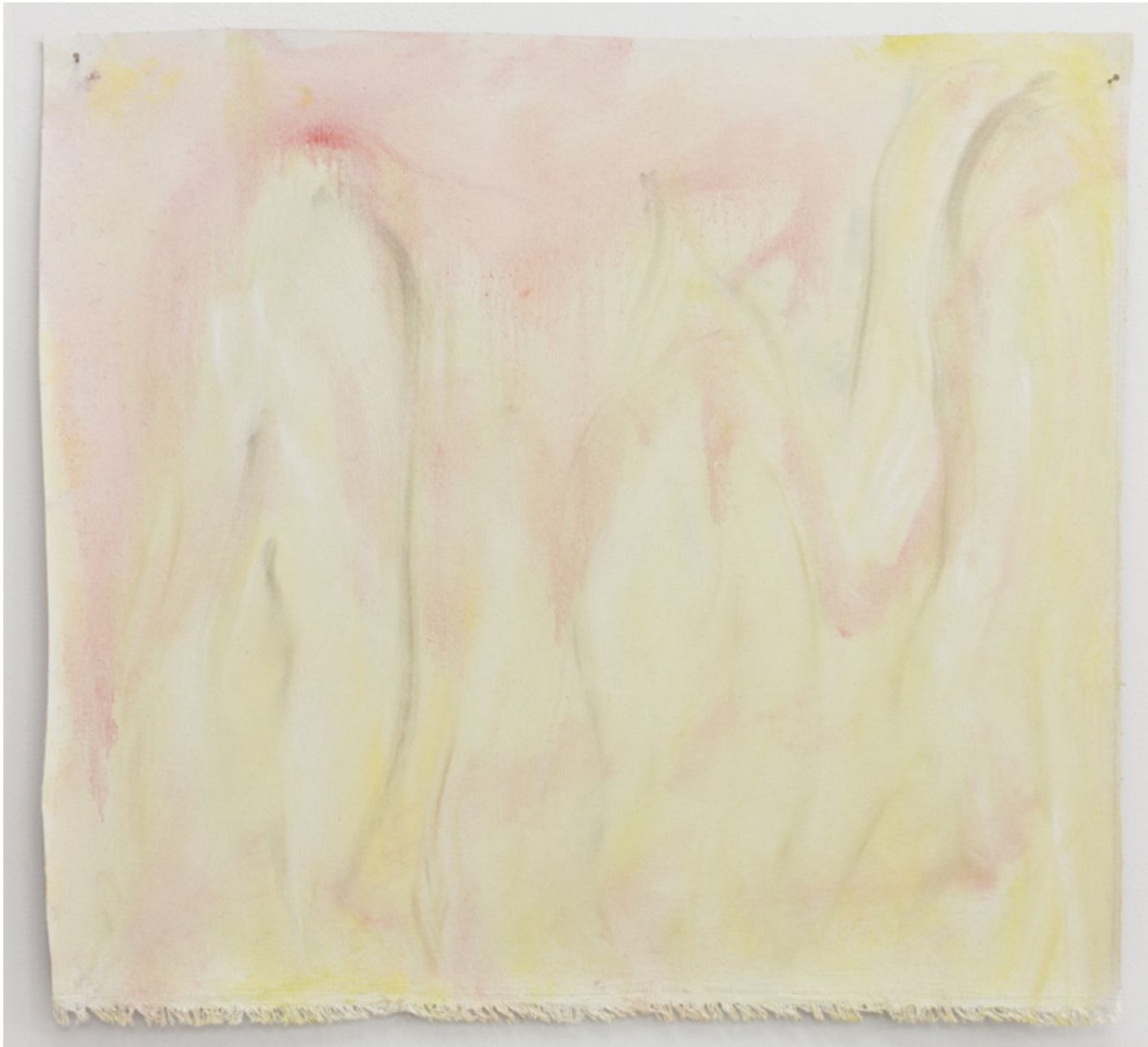
Sunday walk , 43 x 50 cm, walnut oil and oil on canvas, 2023