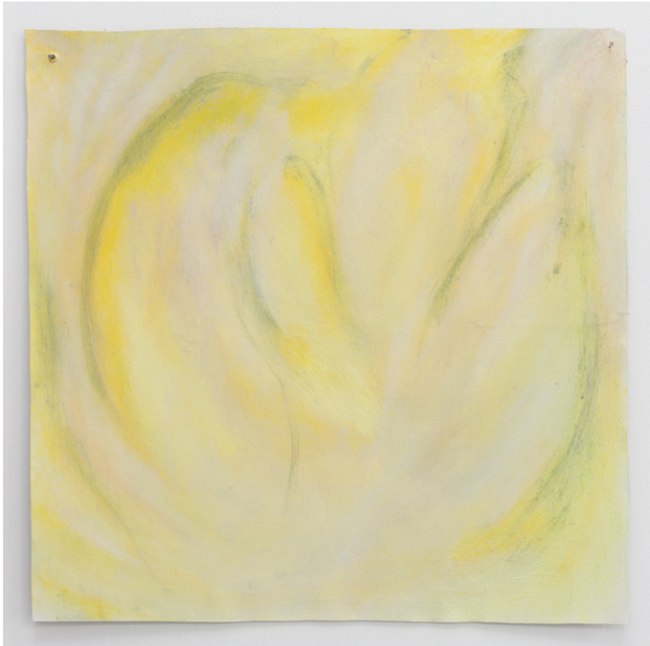
Lillet , 43 x 50 cm, walnut oil and oil on canvas, 2023