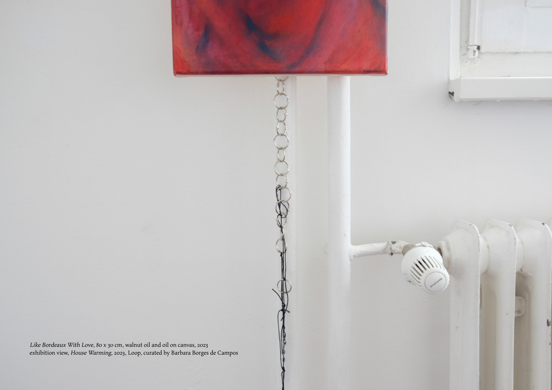
Like Bordeaux With Love , 80 x 30 cm, walnut oil and oil on canvas, 2023 exhibition view, House Warming , 2023, Loop, curated by Barbara Borges de Campos