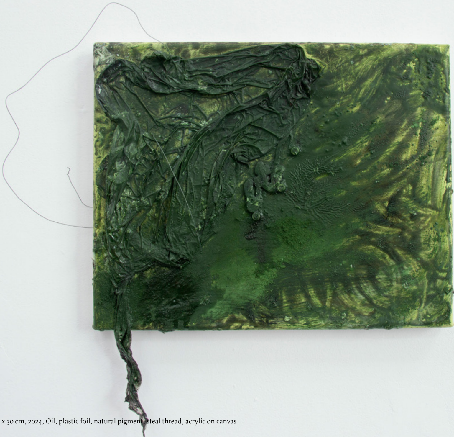
Moss, 20 x 30 cm, 2024, Oil, plastic foil, natural pigment, steel thread, acrylic on canvas.