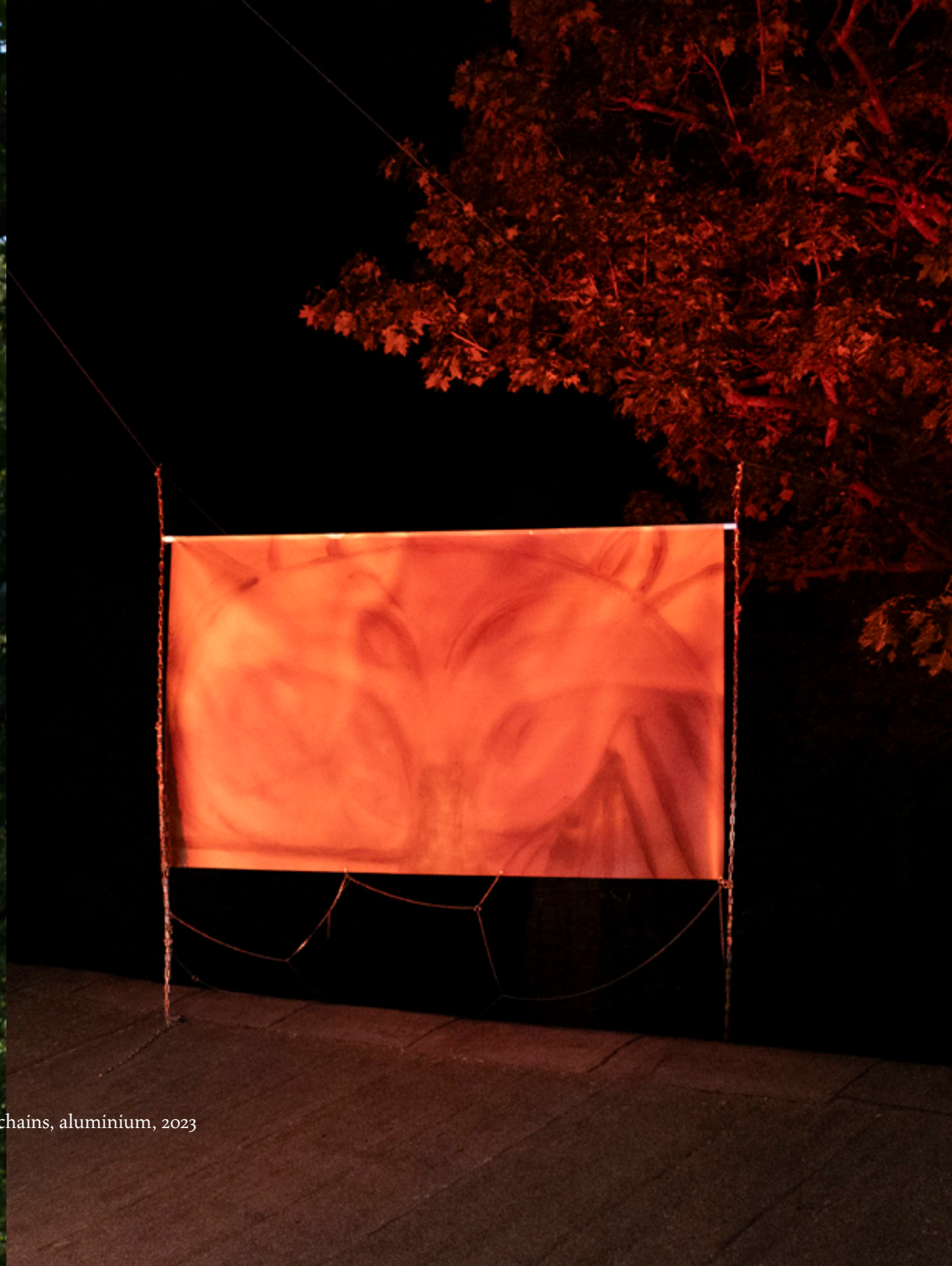
T+ , 250 x 150 cm, acrylics and oil paint, acrylic spray and, digital print on mesh fabric, iron chains, aluminium, 2023 exhibition view, Shrine , Studio Hanniball, Berlin, (day/night view)