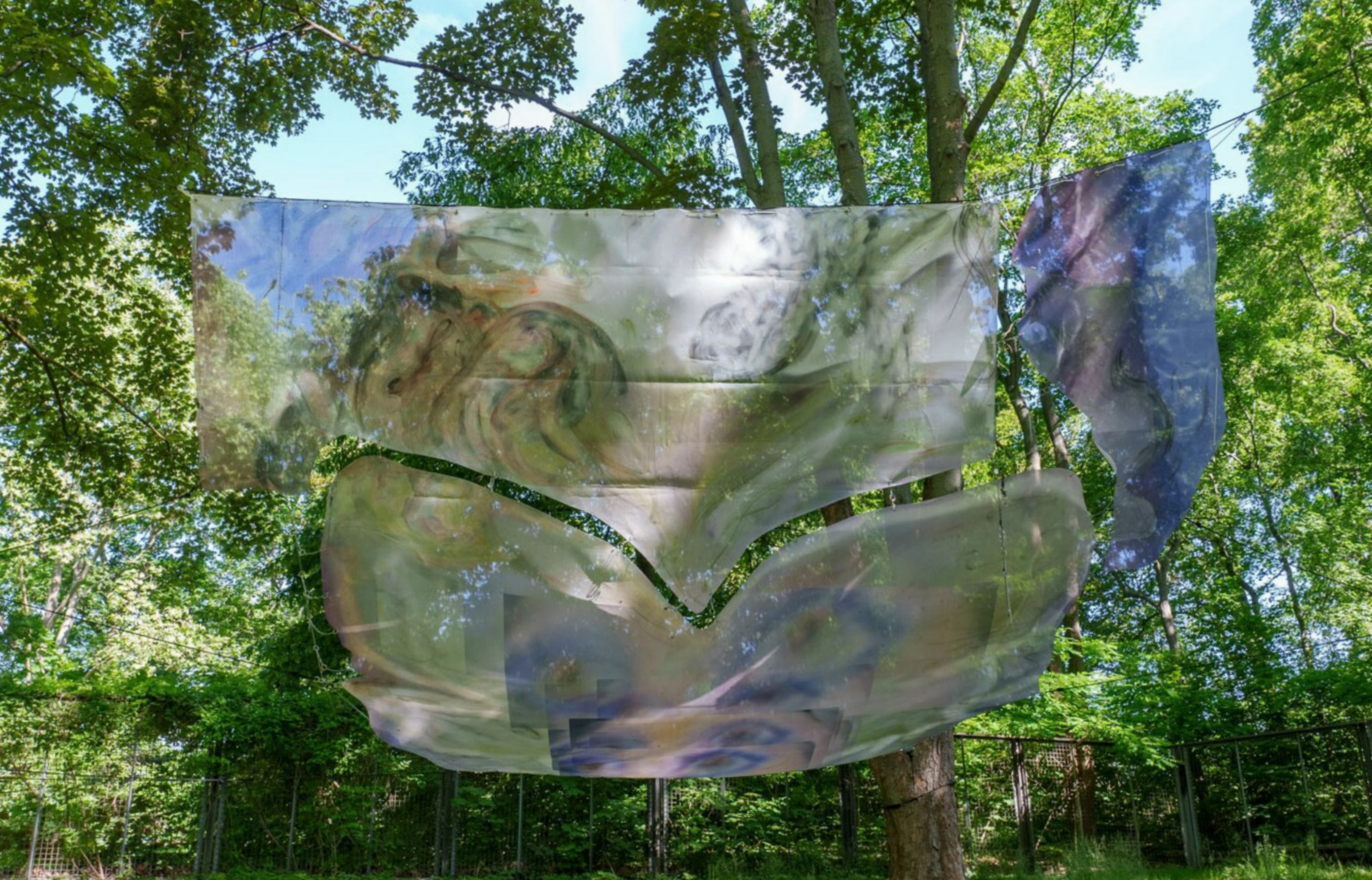
S-e-e-d , 400 x 300 cm, Acrylic and oil paint, acrylic spray, digital print on mesh fabric, steel chains, aluminium, 2023 Exhibition view, Believe, Kunstraum Tropez, Berlin