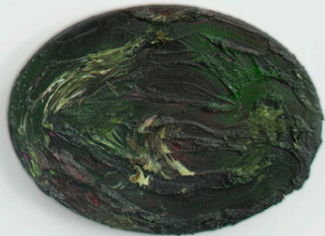
Highfalutin , 25 x 25 cm, Oil and natural pigments on canvas, 2024 (left); Favour flavours , 20 x 25 cm, Oil and natural pigments on canvas, 2023